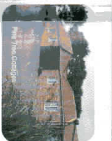
Pine Trees Cottages