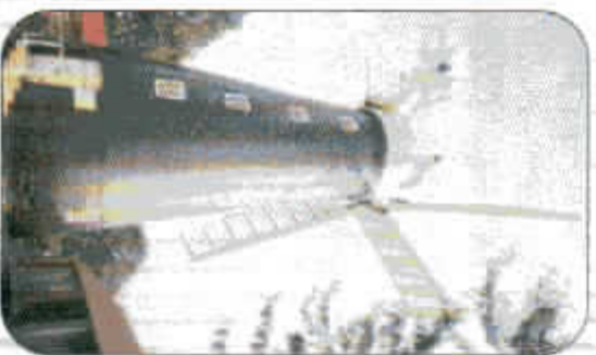
Highly Le Marchant

The ancient city of Lincoln boasts what many regard as Europe's finest cathedral as well as a castle, museums and excellent shopping. Historic houses abound, many with splendid gardens. To the south lie the tulip fields of Spalding with its famous flower parade each May.